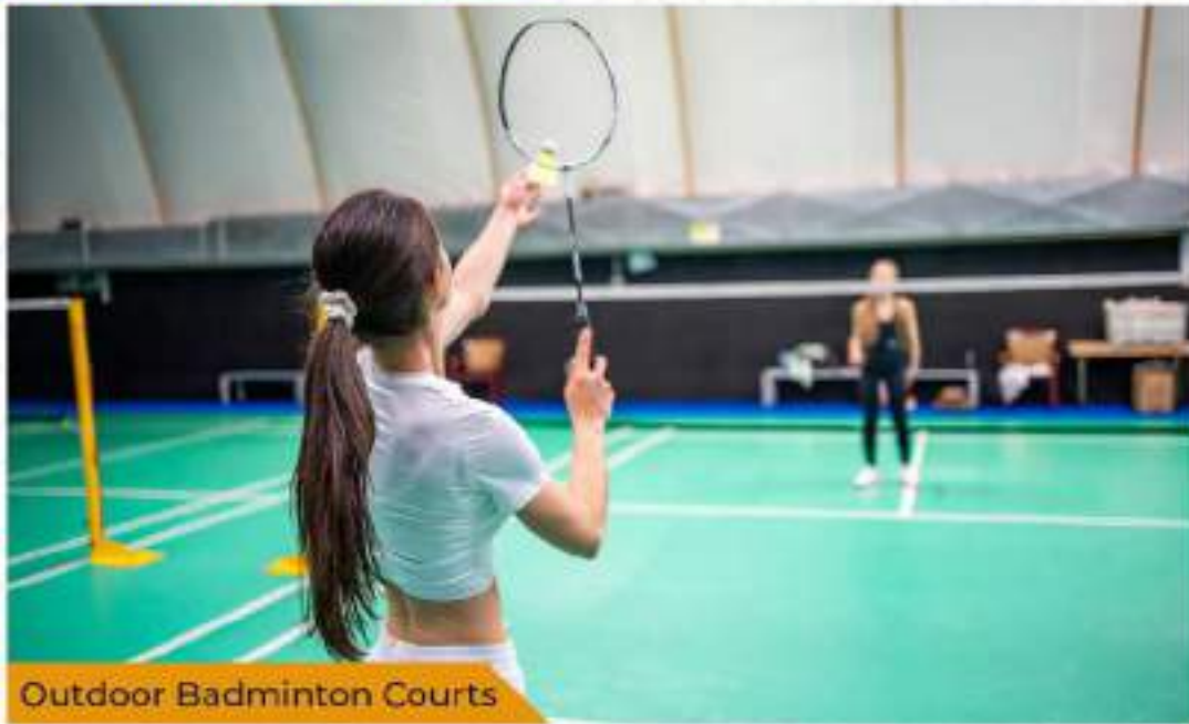
Outdoor Badminton Courts