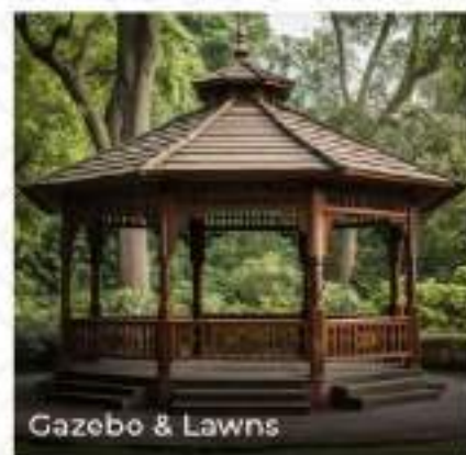
Gazebo & Lawns

As long as the penetration into the ways and means of a proper physical perfection is made a regularity in life, the human soul achieves the line of control over the celebration of life. Love the life and live to excel.