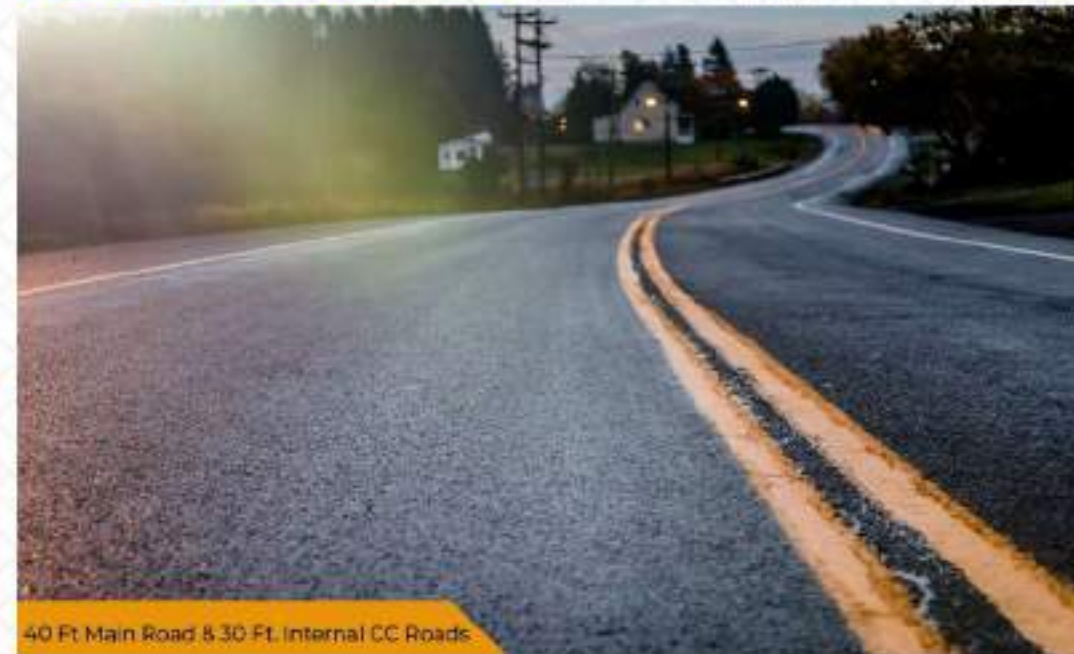
40 Ft Main Road & 30 Ft. Internal CC Roads